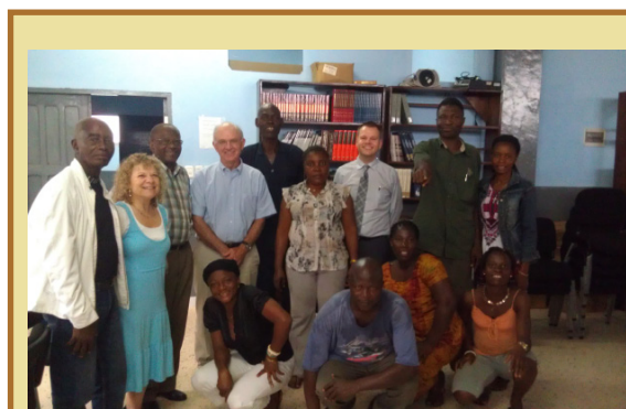
Lamar Soutter Librarians work to expand global health information access in Liberia at the University of Liberia, A.M. Dogliotti College of Medicine, Health Sciences Library, Monrovia