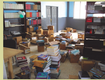
Dogliotti Library receives generous donation of 8,000 volumes to start the medical collection.