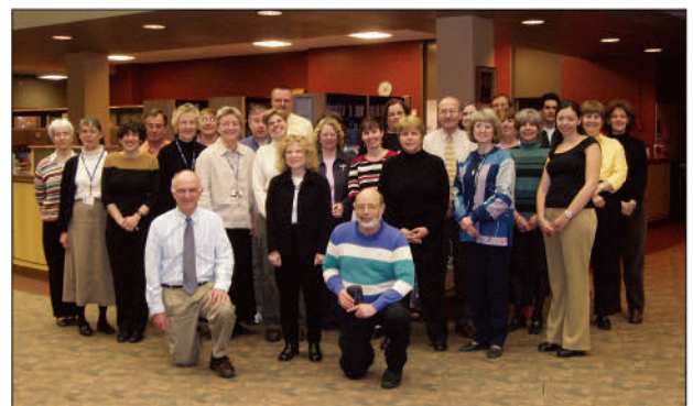
The Staff of the Lamar Soutter Library

The Lamar Soutter Library University of Massachusetts Medical School http://library.umassmed.edu/changingthefaceofmedicine/ Exhibit developed and/or made possible by: NLM, ALA, NIH-ORWH, AMWA